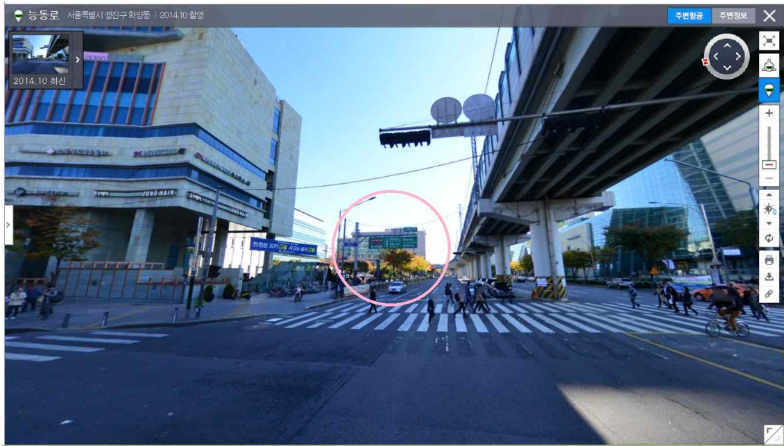
A view of the venue (in the circle) if you are waiting for the pedestrian signal to cross the road.